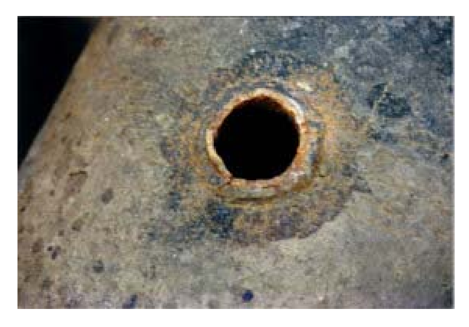
Fig. 3. Weld on main Line, residue beneath 1.5" valve, note cracking in the weld and Luder lines around weld indicating stress field. This was removed for metallographic investigation.

The investigation commenced soon after the explosions with a preliminary survey. On of the principles adopted as a philosophy by Mattech is that it is important in any investigation to avoid premature conclusions. The purpose of the inspection visit was to gather as much information as possible and to