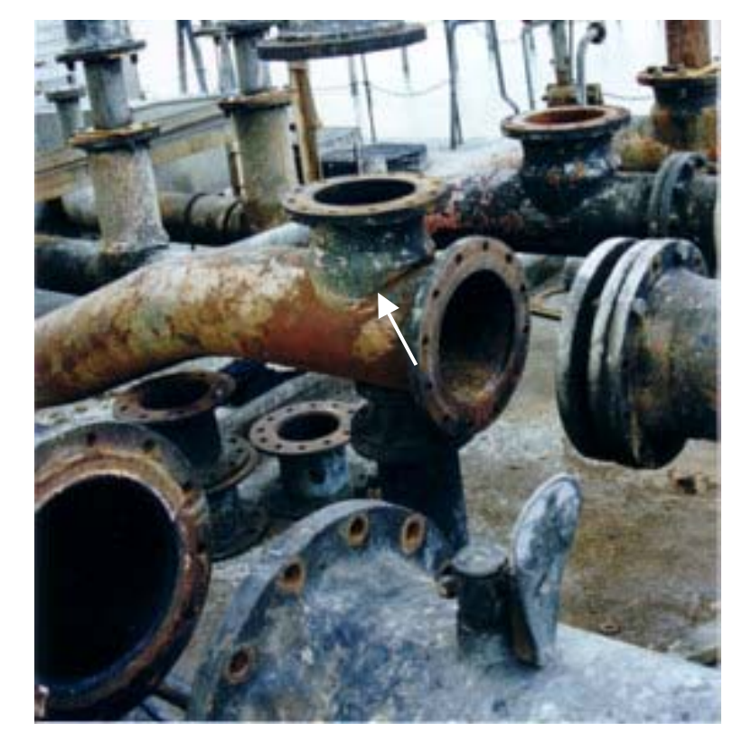
Fig. 4. Nozzle remote from explosion, note crack propagating from weld, investigated as possible source of air ingress

The largest explosion was in the buried section of the line, see Fig.1. It was thought by the operators of the line to be the origin of the explosion and, initially, attention was concentrated here.