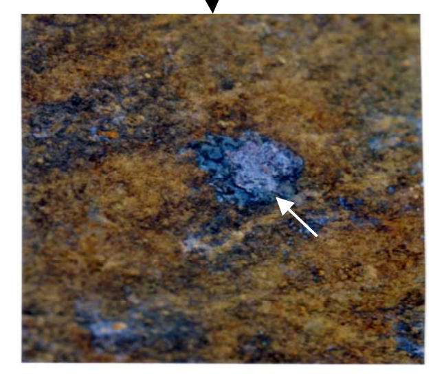
Fig. 12 View under microscope of exploded section of pipe, note melting of oxide layer. Indicative of initiation point of explosion.