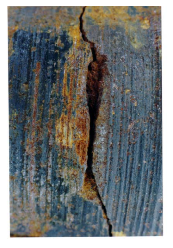
Fig. 8 Typical Cracking in plug on upstream side of valve.

As part of the investigation, valves were removed for examination. It was noted that the plug of one valve was cracked, see Fig.7. This was located on the upstream of the valve, which was positioned on the unused line above the explosion damage seen in Fig. 11. On the downstream side of