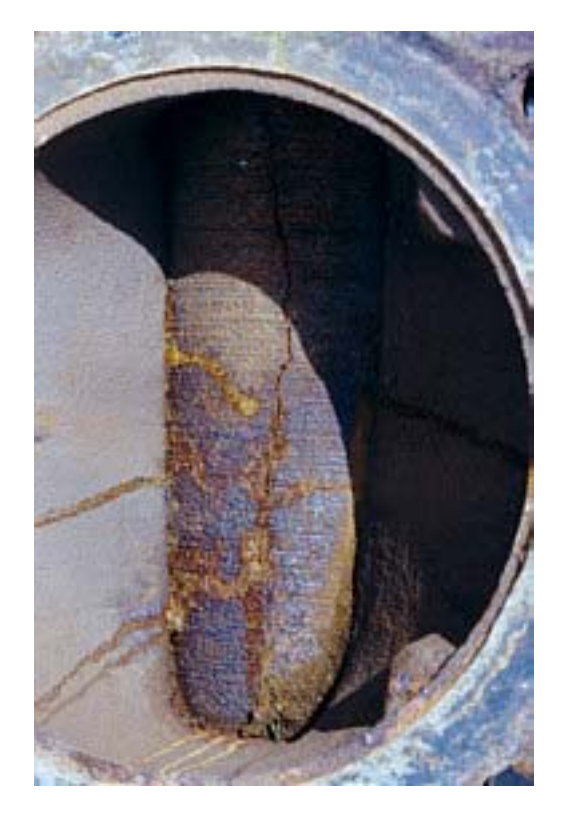
Fig. 7 Cracking in upstream side of plug valve this valve was located above an exploded region of the pipeline

were all of recent origin and thus were symptoms and not initiators of the explosions.