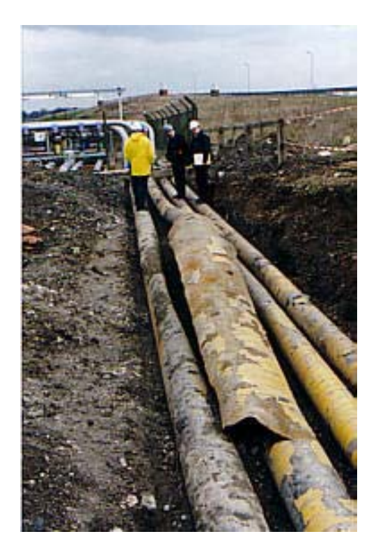
Fig. 1. General View of Surface Pipeline Explosion

The operation is normally accomplished as an everyday event without incident. The least risk procedure is to have the line purged with nitrogen as a precaution against the presence of explosive air/fuel mixtures.