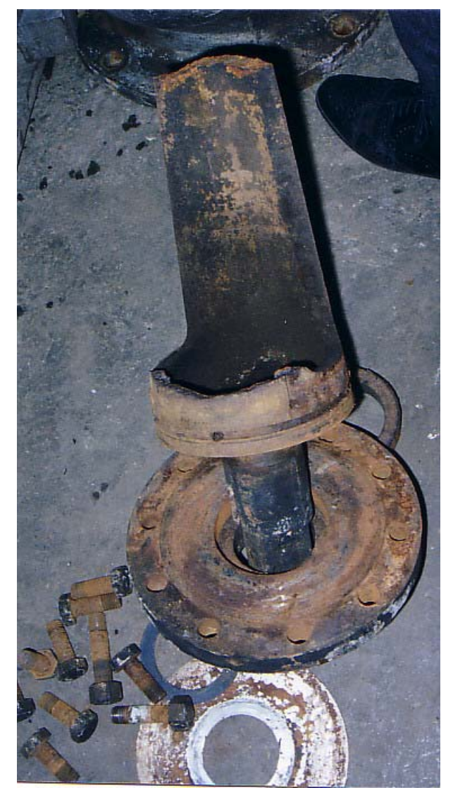
Fig. 9 Fractured plug with downstream side missing

the cast iron material of construction had suffered corrosion and this had resulted in intergranular cracking. It was therefore apparent that the fracture here had been present prior to the explosion.